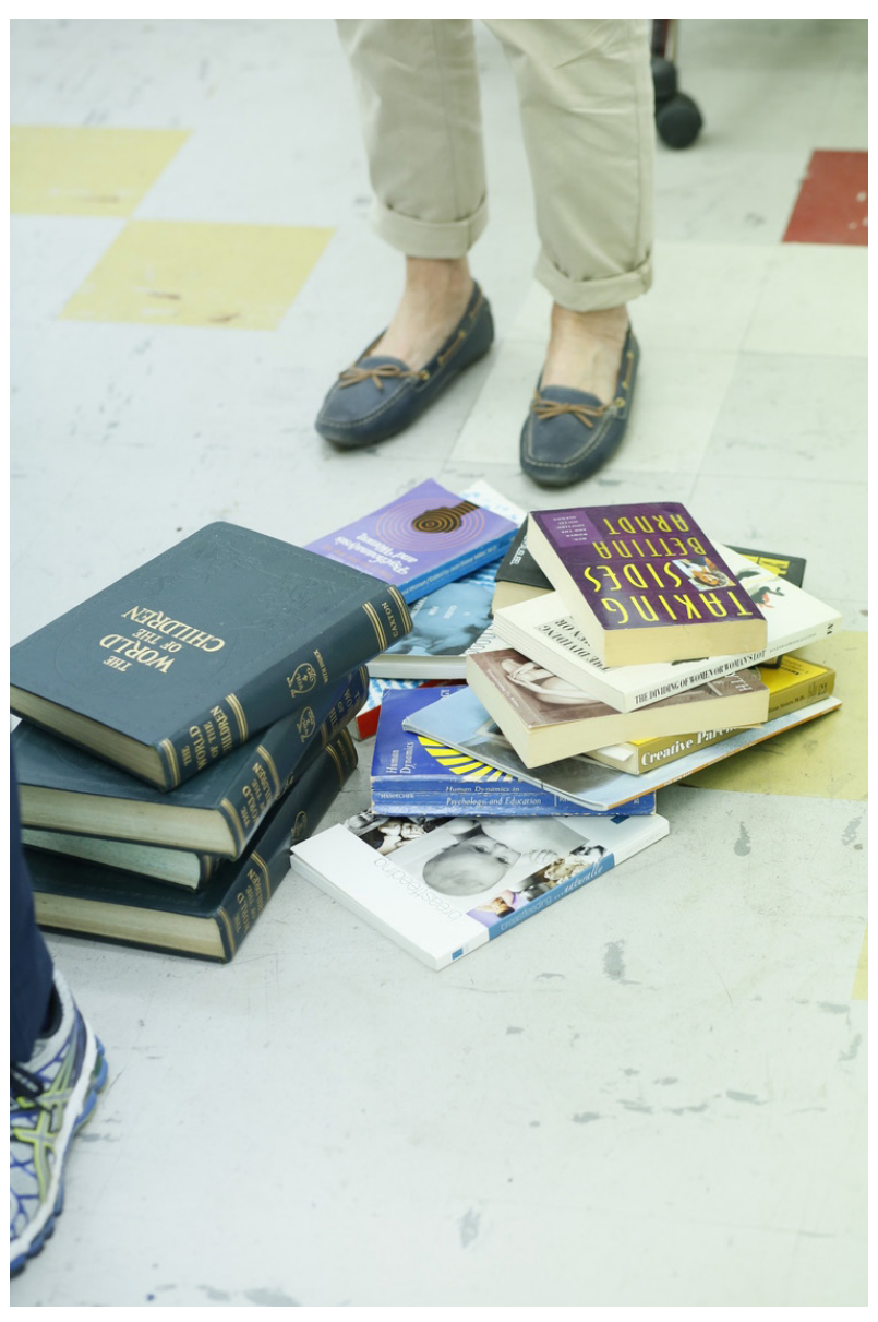
Kym Maxwell, Text intervention, Re-raising Consciousness, TCB Art Inc., 2014.